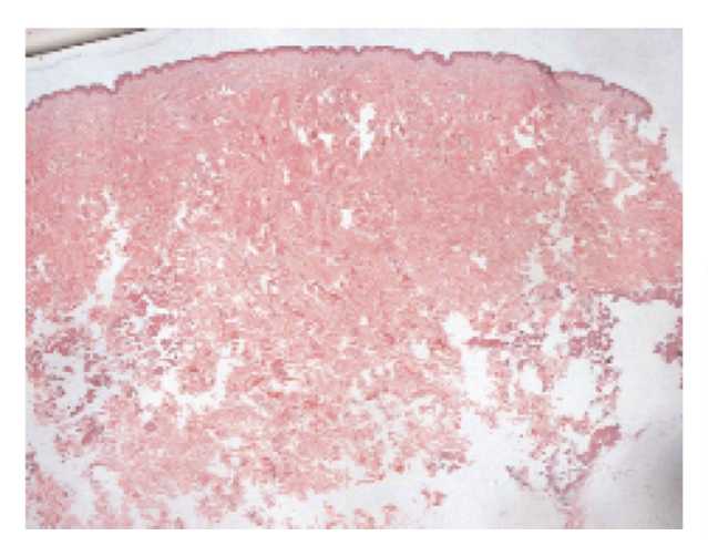
Figue 1. Necorsis inside deep dermis

A Few competitive instruments have been available on the market since this product has used a relatively new technology. As we are concerned about the possibility of the residue of an alloy being deposited inside the skin, it is important that needles must be non-insulation. Also, the need for continuous treatment requires reasonable medical bills.